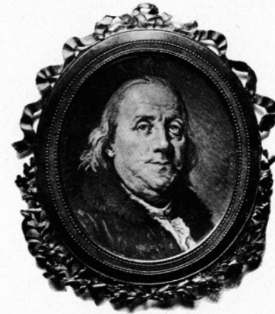
MEDALLION OF BENJAMIN FRANKLIN

9. Gift. Donated by Member, 11/21/58, Per Treasurers Office