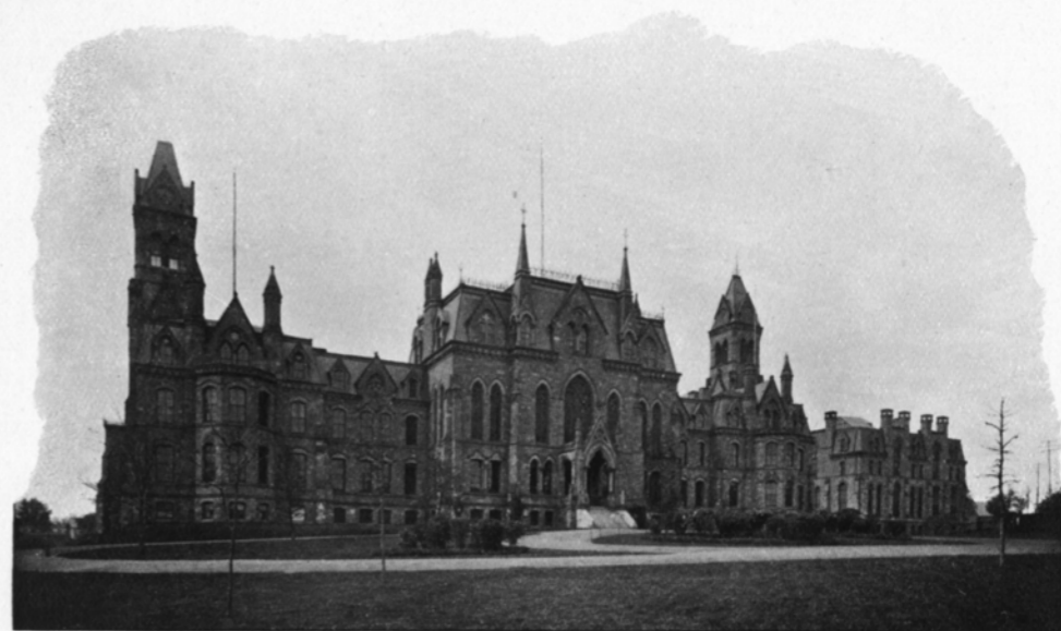
THE COLLEGE BUILDING