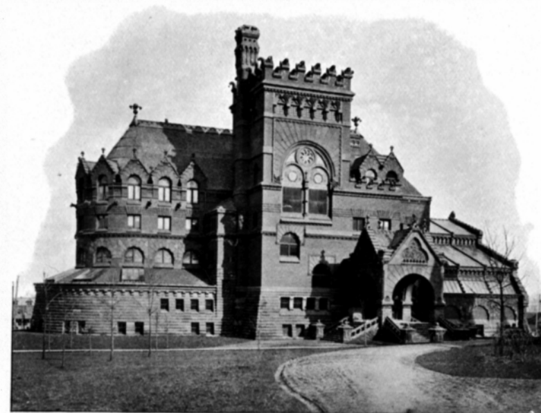
THE LIBRARY BUILDING