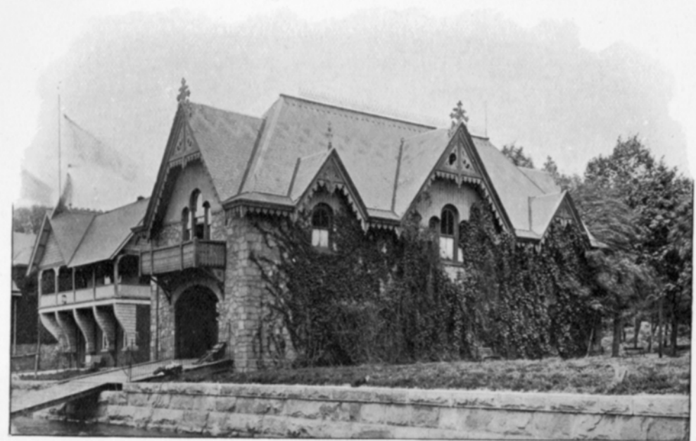
THE BOAT HOUSE